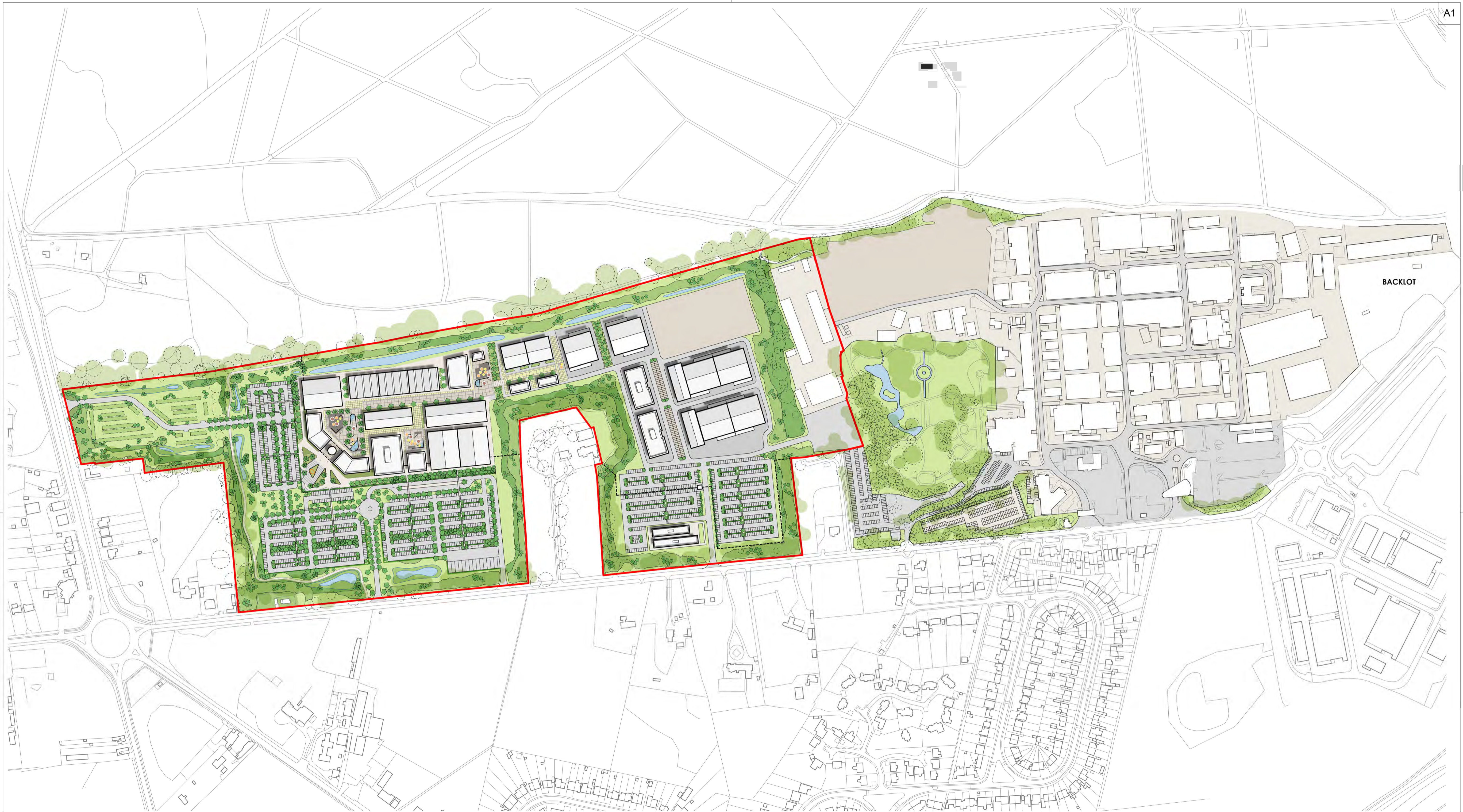
Illustrative masterplan option A 1:2500