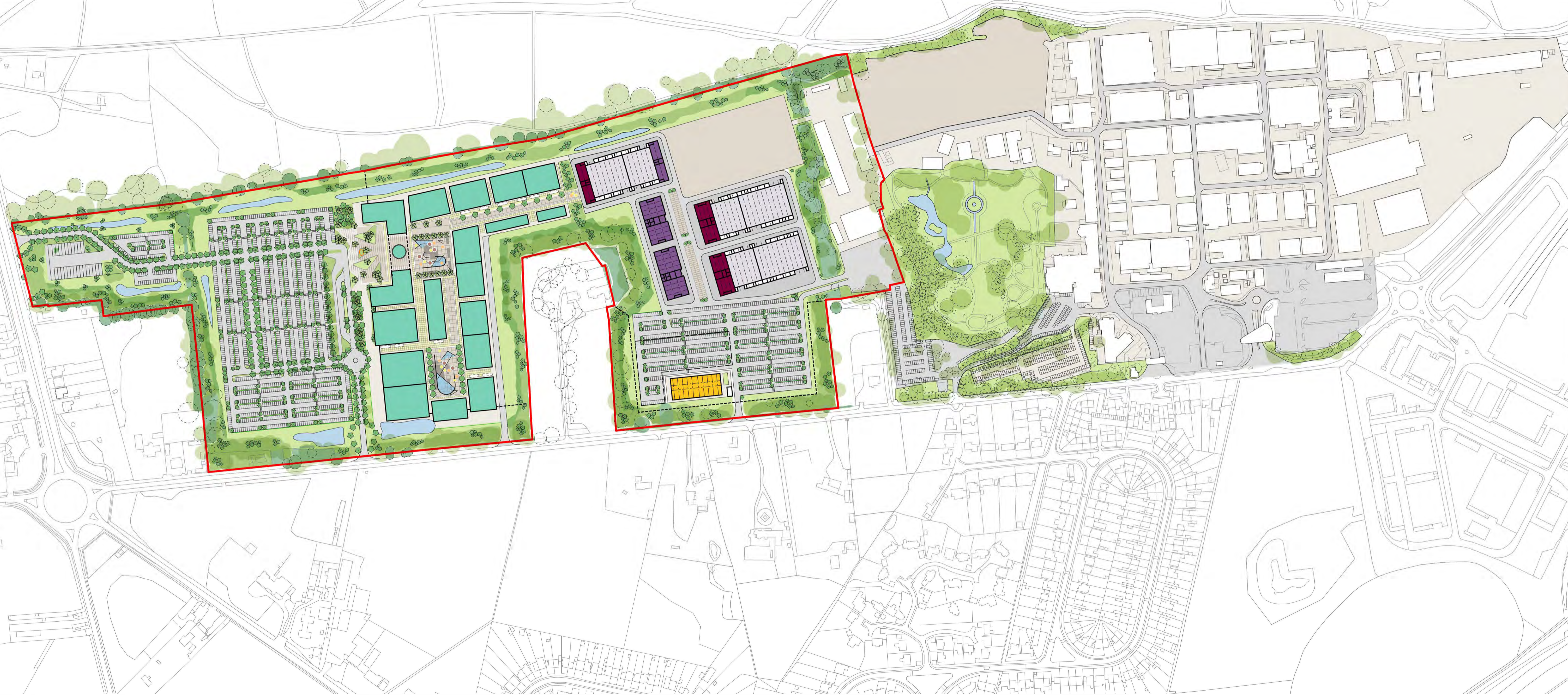
Illustrative masterplan option B 1:2500